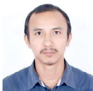
By: W. Rorckchand Singh

No doubt, the voluntary agencies engaged in leprosy eradication has created an awareness among the people that leprosy is not a curse and this is just another disease but the Government should come out with comprehensive strategy at various levels of medical along with a massive health education campaign for early detection & proper rehabilitation. It is necessary to have treatment-cum-rehabilitation centres where the capacity of the patient to earn his living is restored and re-established. Not only this but we all can also help in eradicating the leprosy by spreading the message that it is the least infectious and a person should contact if a pale or red patch on the skin is noticed. We all should remember that Leprosy is curable; early treatment ensures deformity less cure. Leprosy has, for many years, been associated with poverty. Let us raise awareness on the need of breaking the poverty cycle all over the world..