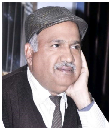
By- Vijay Garg

Although the importance of all the seasons has been told in Hinduism, but the spring season is considered special, the weather makes us feel the change of nature, every changing season brings with it a new message, according to the nature of the country of India, total 6 seasons are major. It is considered as spring season, winter season, winter season, spring season, summer season, rain and autumn season. In these, spring is considered the king of all